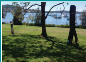
Tanifa O Tagaloa Fatu Feu'u