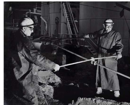
Tapping a blast furnace 1965 silver gelatin photograph 41 x 50.5cm © the artist's estate

(C) What are the men wearing? Why do you think they are wearing those things?