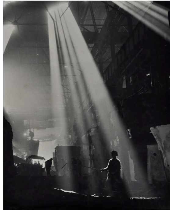
Spotlight in industry 1962 silver gelatin photograph 50.5 x 41cm

5. (A) and (C) Find the photograph Spotlight in Industry . (C) Why do you think the artist called it that?