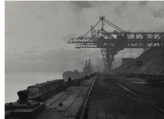
Dawn at the BHP n.d. silver gelatin photograph 25.5 x 37cm

(C) Do you think the title describes the image well? What makes you think that?